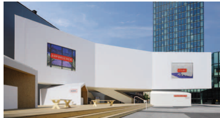
Schaulager Satellite Messeplatz Basel / Art Basel 4-17 June 2012