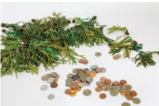
Display cases Schaulager Satellite: Materials for preserving and restoring Robert Gober's «Untitled 1995–1997»

Matthew Barney, «DRAWING RESTRAINT 13: The Instrument of Surrender» (2006) petroleum jelly, plastic, and black sand, varying dimensions Laurenz Foundation, Basel and The Museum of Modern Art, New York