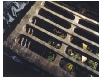
Robert Gober, «Untitled 1995–1997» (1995–1997), detail

Robert Gober, «Untitled 1995–1997» (1995–1997), multi-part installation, mixed media Emanuel Hoffmann Foundation, permanently installed at Schaulager Basel