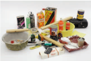
Display cases Schaulager Satellite: Peter Fischli and David Weiss, original objects, carved in polyurethane for the sculpture «Tisch» (1992–1993)

Objects from the studio Peter Fischli (*1952) and David Weiss (1946–2012), used as models for the carved and painted polyurethane objects for the installation «Tisch» (1992–1993)