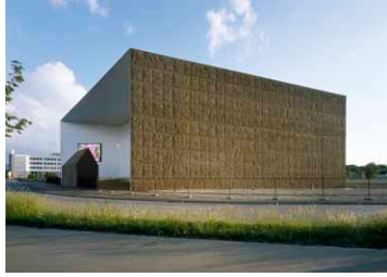
Schaulager, Münchenstein / Basel, Switzerland Architects: Herzog & de Meuron