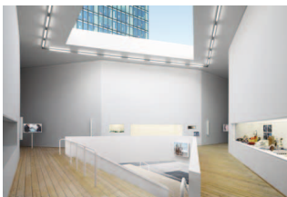
Schaulager Satellite Messeplatz Basel / Art Basel 4-17 June 2012