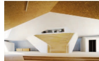
Schaulager Satellite Messeplatz Basel / Art Basel 4-17 June 2012