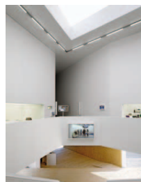
Schaulager Satellite Messeplatz Basel / Art Basel 4-17 June 2012