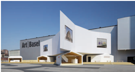
Schaulager Satellite Messeplatz Basel / Art Basel 4-17 June 2012