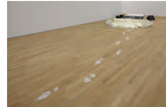
Matthew Barney, «DRAWING RESTRAINT 13: The Instrument of Surrender» (2006), exhibition view, «Matthew Barney, Prayer Sheet with the Wound and the Nail», Schaulager Basel, 2010

Shoes used to create the petroleum jelly footsteps in «DRAWING RESTRAINT 13: The Instrument of Surrender» (2006) by Matthew Barney (*1967)