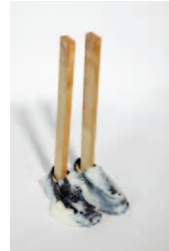
Display cases Schaulager Satellite: Matthew Barney, shoes used to create the sculpture «DRAWING RESTRAINT 13: The Instrument of Surrender» (2006)

Peter Fischli and David Weiss, «Tisch» (1992–1993) c. 750 carved and painted polyurethane objects and table, varying dimensions Emanuel Hoffmann Foundation, on permanent loan to the Öffentliche Kunstsammlung Basel