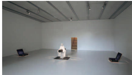
Robert Gober, «Untitled 1995–1997» (1995–1997), permanent installation at Schaulager Basel © Robert Gober

Objects from Schaulager's restoration department used for studying and conserving the installation «Untitled 1995–1997» by Robert Gober (*1954), permanently installed at Schaulager.