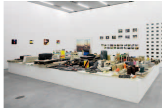
Peter Fischli and David Weiss, «Tisch» (1992–1993), installation view at Schaulager Basel Photo: Tom Bisig, Basel © Fischli/Weiss

Objects from the studio Peter Fischli (*1952) and David Weiss (1946–2012), used as models for the carved and painted polyurethane objects for the installation «Tisch» (1992–1993)