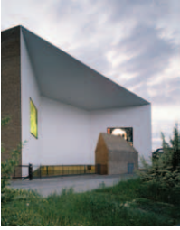
Schaulager, Münchenstein / Basel, Switzerland Architects: Herzog & de Meuron

All images and press texts can be found on our website www.schaulager.org/satellite , under 'Media Service'