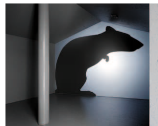
Philipp Gasser «Always Quietly Active» (2012) Schaulager Satellite Messeplatz Basel / Art Basel www.schaulager.org/satellite 4-17 June 2012