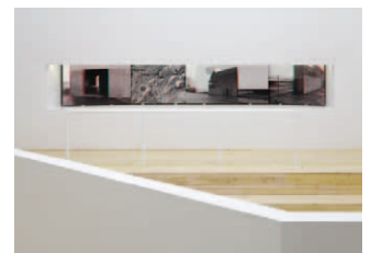
Thomas Ruff «Schaulager 3D» (2012) Schaulager Satellite Messeplatz Basel / Art Basel 4-17 June 2012